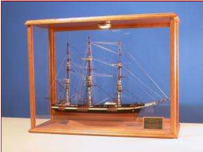
40-1/2" Long x 26-1/2" High x 17" Wide

Scottish Rite 2008 Fundraiser All Proceeds To Benefit The Cathedral Foundation